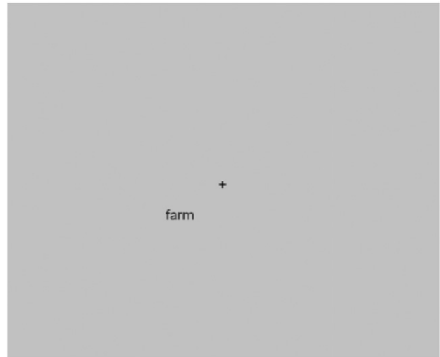
Fig. 1. Attention-control task stimuli. A fixation point was located in the center of the screen. Words were presented just below the fixation point and either to the left or right of the fixation point. Forty-six words were displayed per block for 4.5–7.5 seconds each. The total task time for each block was 4.6 minutes.

Our self-control manipulation used a common task that has been successfully used in prior depletion research (Schmeichel et al., 2003; Vohs & Faber, 2007). All participants were instructed to fix their attention on a small cross in the middle of a computer screen while words periodically appeared onscreen (Fig. 1). Participants in the attention demanding condition were told to ignore the words on the screen. If they found themselves attending to them, they were instructed to revert their eyes immediately back to the fixation cross. Participants in the